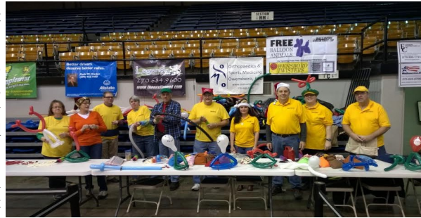
Twisting an event at the Sports Center.

Well, my 9-year-old daughter and I gave it a try and we can now twist a dog, flower and sword!