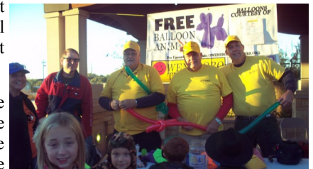
The Twisters twisting at the Trail of Treats at Smother's Park.